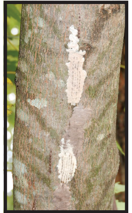
Spotted lanternfly egg masses under their plaster-like covering are often found on trees or flat surfaces of vehicles in the late-summer through winter.

Whenever you can, please take a few minutes to inspect your vehicle and outdoor equipment for signs of these species, their eggs, or other unwelcome hitchhikers. Pressure wash your undercarriage or recreation equipment and scrape off and squish any insect hitchhikers and their eggs. It makes a very satisfying sound! Visit extension.psu.edu/what-should-you-do-with-spotted-lanternfly-egg-masses .